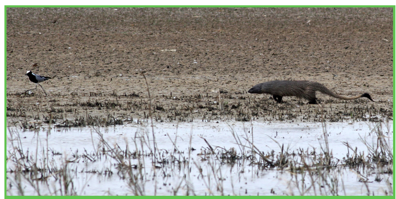
Photo 1. The Large Grey Mongoose (Herpestes ichneumon) - note the characteristic black tail-tip - is mainly associated with riparian, lacustrine or coastal habitats

The Large Grey Mongoose is generally diurnal, with peaks of activity in the morning and late afternoon (Palomares & Delibes 1992b; Maddock & Perrin 1993). During the night it sleeps singly or in family groups (see below) in underground dens or dense thickets (Palomares & Delibes 1993b). The species is crepuscular in Israel (Ben-Yaacov & Yom-Tov 1983) and, according to Palomares (2013), nocturnal activity may take place where individuals are subject to human disturbance. Most of the active time is spent foraging, while travelling and social interactions only occupy a minimum of time every day (Palomares & Delibes 1992b, 1993c). Foraging is characterised by intense prey searching. Animals walk with the nose close to the ground, inspect every small hole, frequently