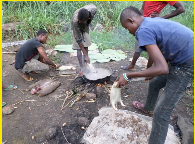
Photo 2. Temminck's Ground Pangolins ( Smutsia temminckii ) are widely used for bushmeat (African Pangolin Working Group)

8,065 km of roads across its range, there are an estimated 280 pangolin deaths on roads per year. The exact extent of this threat is difficult to quantify due to persons removing carcasses from roads for muthi and bushmeat, and for the novelty factor (for example, having animals stuffed for display). The severity level is believed to be relatively low at present, but this should be monitored.