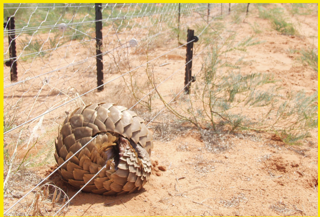
Photo 1. Temminck's Ground Pangolin ( Smutsia temminckii ) entangled in an electric fence line