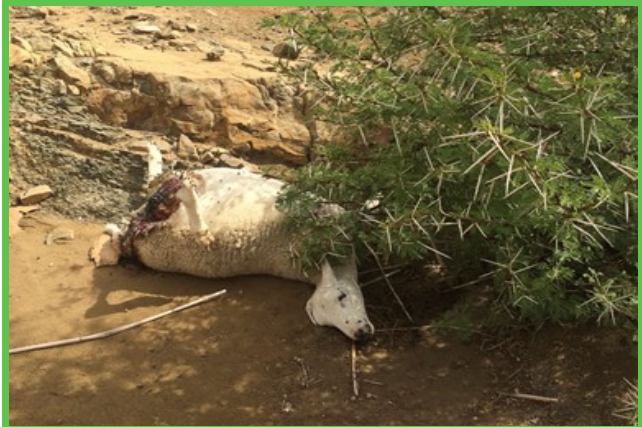
Photo 1. Ewe killed by a female Caracal ( Caracal caracal ) on a farm in the central Karoo

species may actively limit each other's numbers in certain areas; their diets do not only overlap to a large extent, but they have been reported preying on each other's young (Ferreira 1988; Pohl 2015), and adult Caracal even kill and eat adult Black-backed Jackal (Melville 2004; Q. Martins unpubl. data).