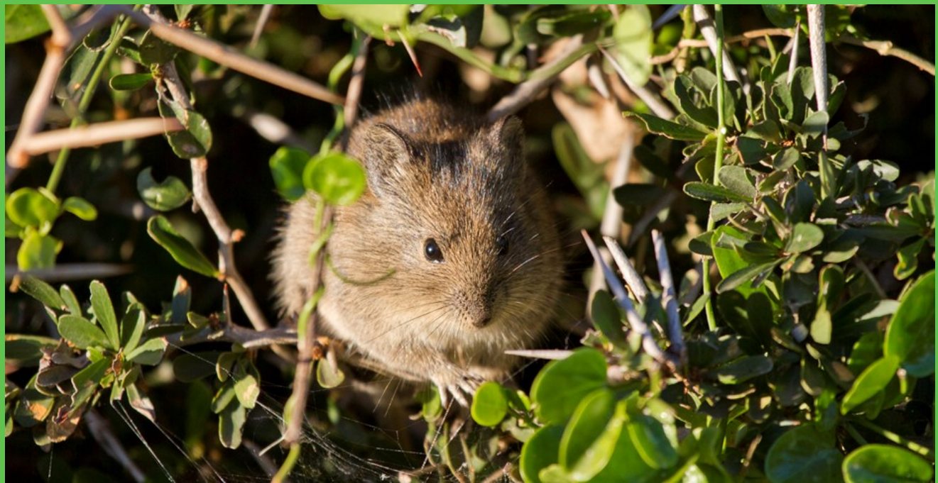
Photo 3. Arboreal feeding in a thorny bushclump in Addo Elephant National Park (Emmanuel Do Linh San)