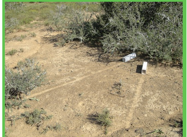
Photo 2. Typical runways observed around lodges. These are used to facilitate live-trapping with PVC traps (Emmanuel Do Linh San)

Rats are both terrestrial and arboreal. They gather large amounts of plant material at the basis of, or on shrubs and bushes, which is then transported back to the nest for consumption, thereby minimising exposure to the macroclimate. Sometimes though, they feed on site, especially when active inside dense bushes (Photo 3). Like other Otomys species, Karoo Bush Rats practice coprophagy, hence eating their own faeces and those of other individuals. This is a particularly important habit in the weaning young, as it supplies them with the proper bacteria for the digestion of plant material. In addition, in the absence of free water in this species’ habitats, food – especially succulent plants – functions as the primary water source. The poor nutritive quality of the diet, requiring large volumes to be fermented in the caecum, is to some extent overcome by the rats collecting large quantities of food while foraging and consuming this later at the nest (Kerley 1989).