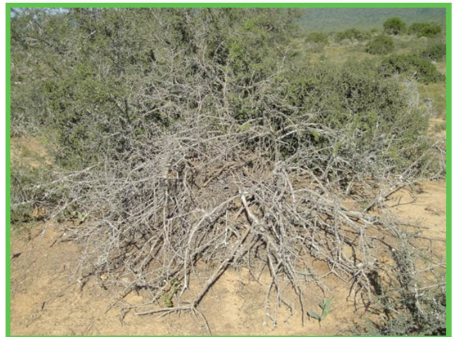
Photo 1. Karoo Bush Rat ( Otomys unisulcatus ) lodge made of sticks and twigs (Emmanuel Do Linh San)

The Karoo Bush Rat is a generalist herbivore, feeding on the leaves, stems, flowers and fruits of succulent karroid vegetation (Brown & Willan 1991; du Plessis et al. 1991; Hoepfl 2013). Locally, up to over 60 plants species have been recorded in the diet throughout the year (Kerley 1989; Kerley et al. 1991; Hoepfl 2013). This generalist dietary adaptation is to be expected in environments with low predictability of annual precipitation and plant growth, with perennials forming a stable dietary base. Karoo Bush