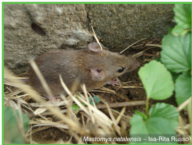
Mastomys natalensis – Isa-Rita Russo

Current population trend: Stable/increasing, based on no net decline in habitat and possible range expansions in the assessment region.