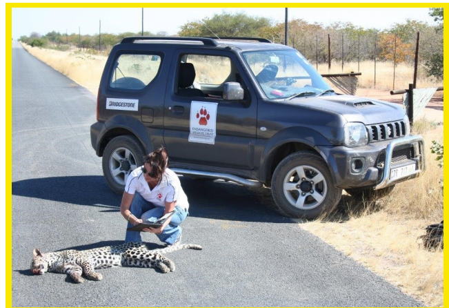
Photo 1. Example of a Leopard ( Panthera pardus ) killed in 2014 on a road within the Greater Mapungubwe Transfrontier Conservation Area

Although Leopards occur in numerous protected areas across their range, the majority of the population occurs outside of protected areas, necessitating a need for improved conflict mitigation measures, trophy hunting management, non-lethal mitigation actions, centralised monitoring of trophy harvest and quality, issuing of DCA permits as well as providing education programmes to ensure Leopards do not become locally threatened. Currently, the best conservation effect on Leopard conservation in South Africa can be made along two general fronts, namely policy development and conflict mitigation. These can be distilled into four pillars of conservation action: 1) livestock and game conflict mitigation, 2) applying sustainable trophy hunting regulations, 3) reducing the illegal trade in skins and 4) protected area expansion to create a more resilient population overall.