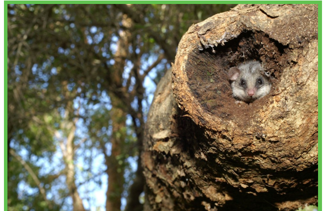
Photo 1. Woodland Dormouse ( Graphiurus murinus ) peeking out from a cavity in a Cape Bushwillow ( Combretum caffrum ) (Emmanuel Do Linh San)

Woodland dormice are seasonal breeders, starting from October up to February (Qwede 2003; Madikiza 2010), and females can produce up to two litters 6–8 weeks apart (Madikiza 2010). At least in some areas, reproduction seems to be associated with high availability and abundance of insects, fruits and high rainfall (De Graaff 1981). After a gestation of about 24 days (Kingdon 1974), females in natural populations give birth to 3–6 young (Lynch 1989). Using extensive trapping and nest box monitoring data, Madikiza et al. (2011) found high intra- and intersexual home range overlaps, with the home ranges of males twice as large as those of females. This, coupled with asynchronous sexual receptivity in females and a complex network and dynamics of sleeping associations (Madikiza 2010, 2017) suggests that