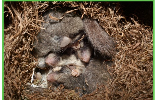
Photo 2. Woodland Dormice ( Graphiurus murinus ) huddling in a nest box during winter (Emmanuel Do Linh San)

Woodland Dormice have a promiscuous mating system. In addition, some females may engage in communal breeding (Madikiza 2010, 2017).