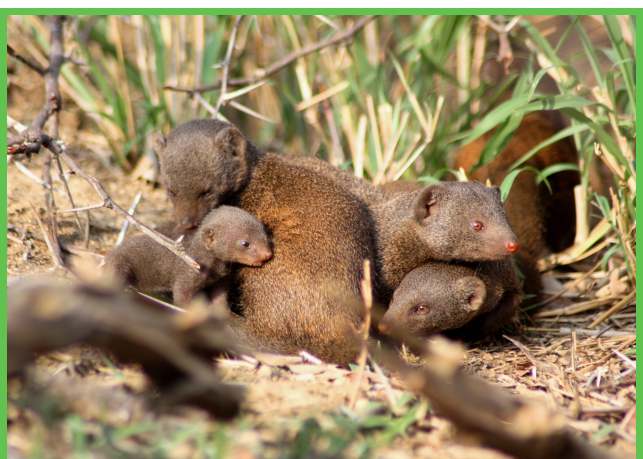
Photo 1. Common Dwarf Mongoose ( Helogale parvula ) pups remain at a refuge, guarded by babysitters, until 4 weeks old.

Dwarf Mongooses inhabit open woodlands, thickets and wooded savannahs, particularly where there are termitaria, rock outcroppings or crevices, or hollow logs and trees for