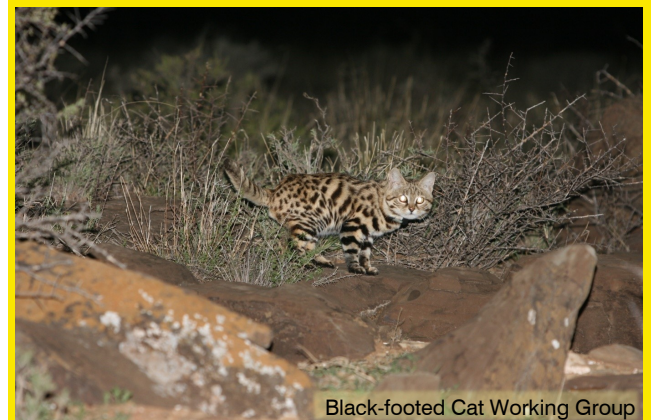
Figure 4. A male Black-footed Cat ( Felis nigripes ) actively hunting

overlapped with those of females by 60–67% (Sliwa 2004). Despite this overlap, all individuals hunted solitarily. Similarly, annual home range sizes of Black-footed Cats were 7.1 km 2 for an adult female, and 15.6 and 21.3 km 2 for two adult males monitored at Benfontein Game Farm, Northern Cape Province, from 2006 to 2008 (Kamler et al. 2015). Since range size is dependent on available prey resources, in more arid regions these home ranges can be considerably larger. Both sexes spray mark, particularly during mating season, when spray marks are deployed in proportion to intensity of use and may play a role in social spacing (Molteno et al. 1998; Sliwa et al. 2010). Adults travel an average of 8.42 \pm 2.09 km per night – a greater distance than the African Wildcat ( 5.1 \pm 3.4 km per night) despite their smaller size (Sliwa et al. 2007).