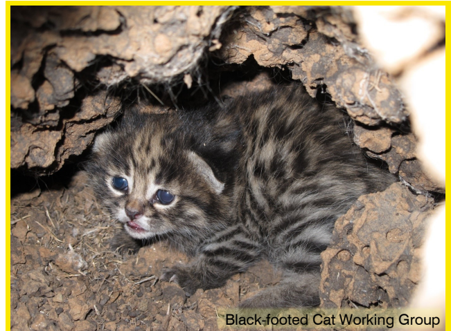
Figure 3. A Black-footed Cat protected in a hollowed-out termitarium

Of 17 radio-collared Black-footed Cats (7 males, 10 females) studied at Benfontein Game Farm, Northern Cape Province, from 1997 to 1998, the home ranges of adult resident males averaged 16.1–20.7 km 2 while those of females were 8.6–10 km 2 , where male home ranges