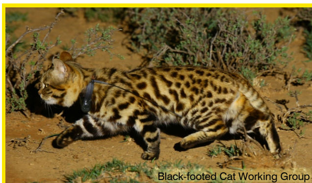
Black-footed Cat Working Group