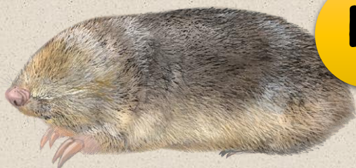
Grant's Golden mole Eremitalpa granti