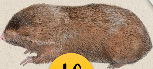
Sclater's Golden mole Chlorotalpa sclateri