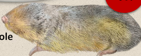
De Winton's Golden mole Cryptochloris wintoni