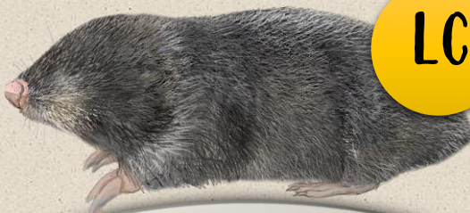
Cape Golden mole Chrysochloris asiatica