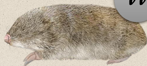
Visagie's Golden mole Chrysochloris visagiei