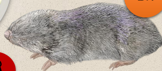
Van Zyl's Golden mole Cryptochloris zyli